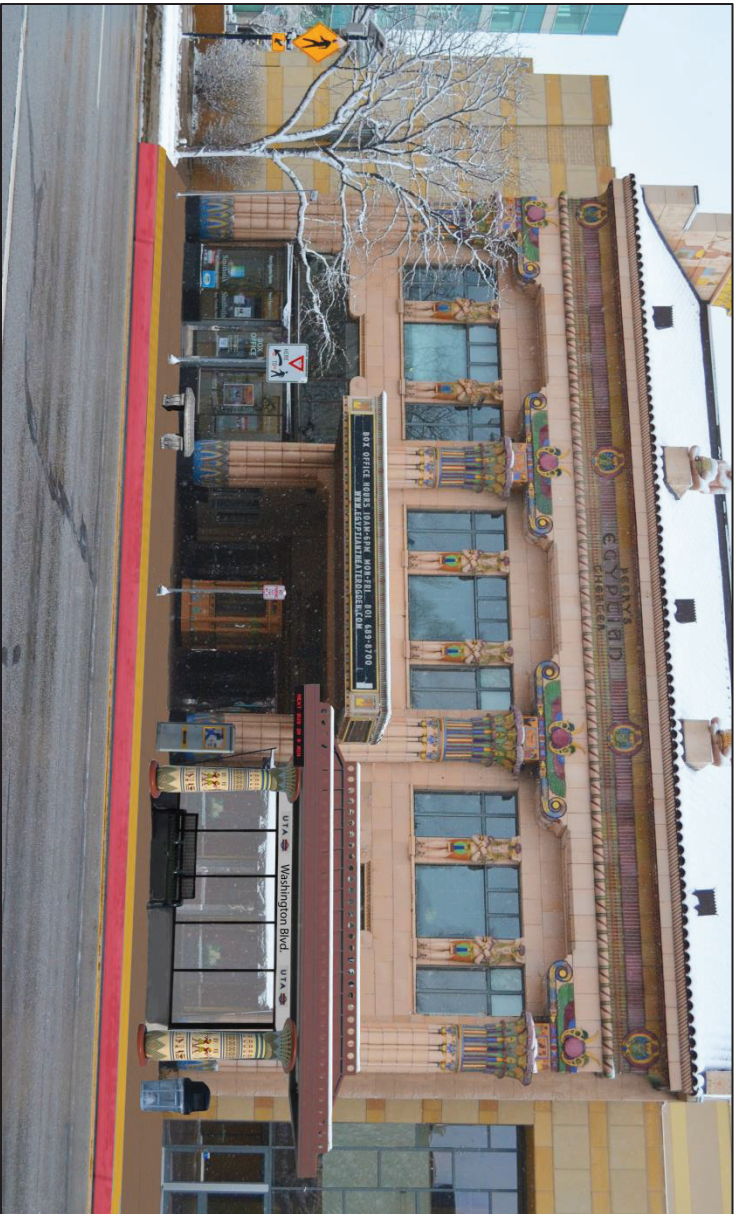
Conceptual design for station at the Peery's Egyptian Theater